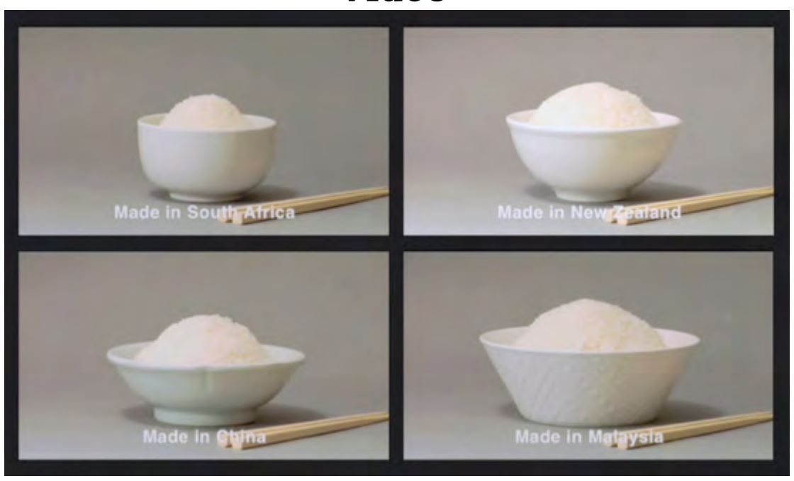
108 Global Rice Bowls, 2008 壹佰零捌個全球化飯碗 Single-channel video. 5:24 min

Each clang corresponds to each of the 108 bowls, like a bell it pierces through emptiness of phenomena and enlightens the mind into awareness. 108 are the number of beads in a Buddhist rosary, a complete cycle of a prayer. Chinese diaspora, diverse voices, sing across the globe.